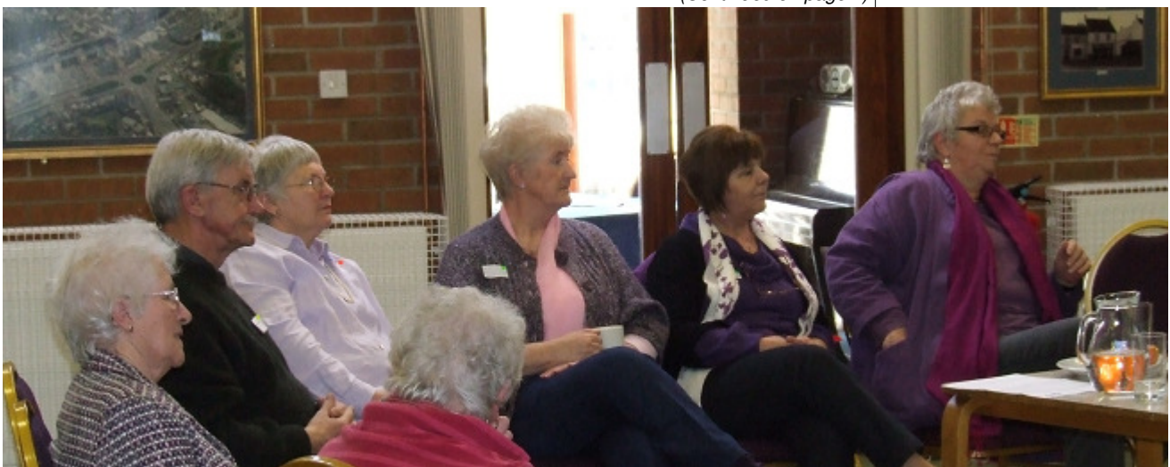
Carers forum 2nd March 2011