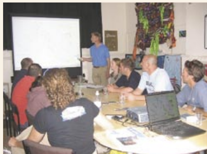
The Global Connections ICT suite being used by a community group

Contact: Nicki Mallen, Global Connections, Eastgate Centre, East End Square, Pembroke, Pembrokeshire, SA71 4DG, Tel:01646 687800, nicola@globalconnections.org.uk