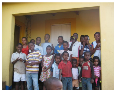
Children at the orphanage