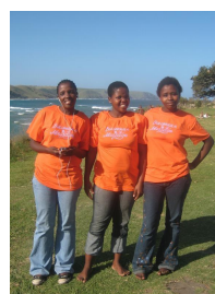
Bulunga massage girls